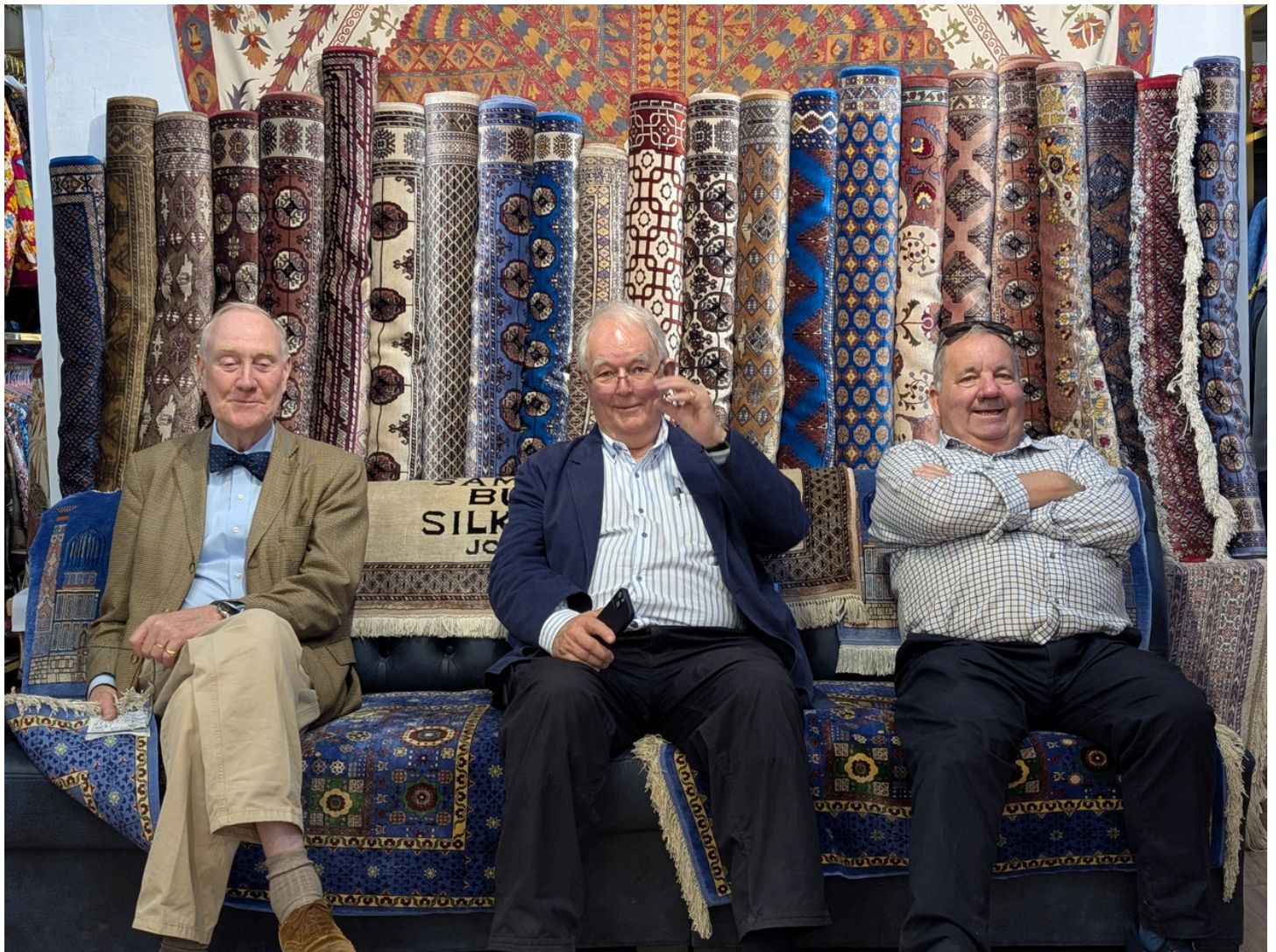
Three wise men in Samarkand