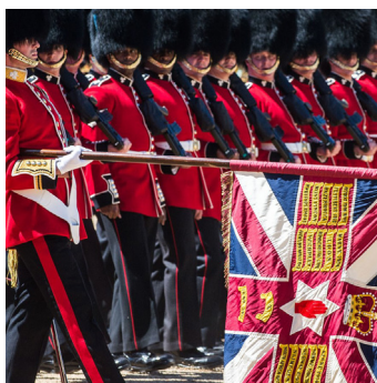
TROOPING THE COLOUR 10 th June