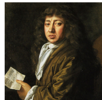
SAMUEL PEPYS & THE COVENT GARDEN PIAZZA 23 th June