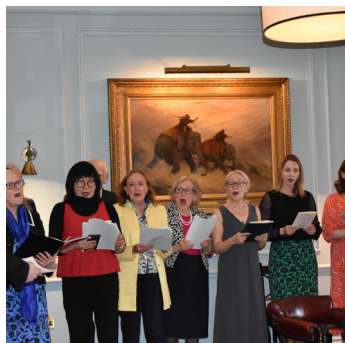
CHORAL COCKTAIL EVENING 19 th May