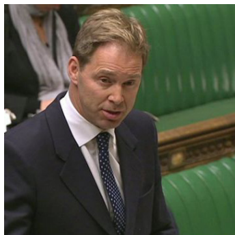
BRIEFING ROOM WITH TOBIAS ELLWOOD 22 nd May