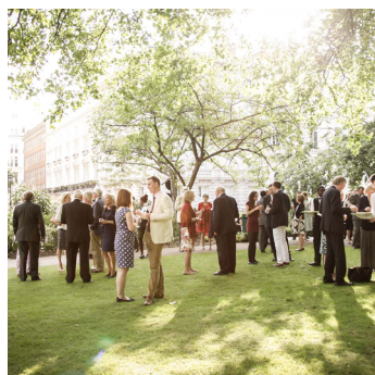
Tri-Club Summer Drinks Reception in the Square