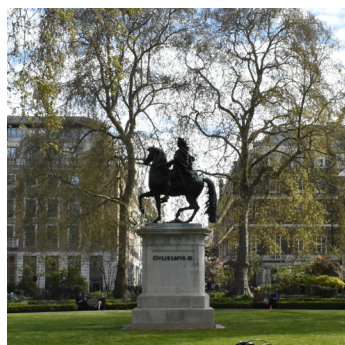
St James's Walking Tour with Blue Badge Guide

Join us for an array of exciting events and happenings this season at the Rag!