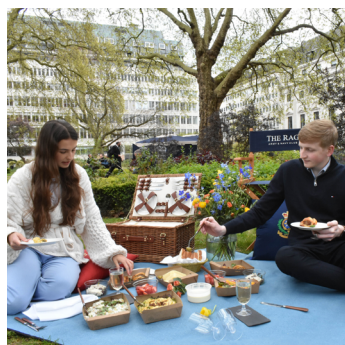
Picnics in the Square