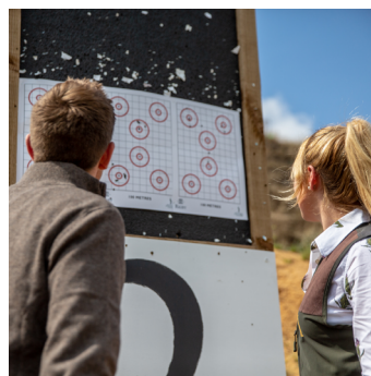
Beasley Shoot at West London Shooting School | U35s