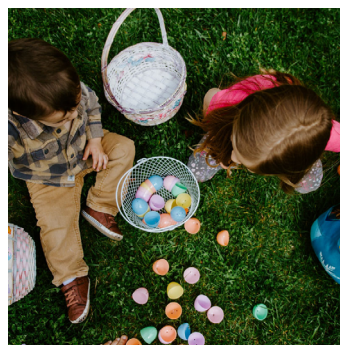
Family Day in the Square