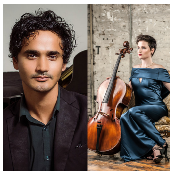
Keeping It Classical A Piano & Cello Duo