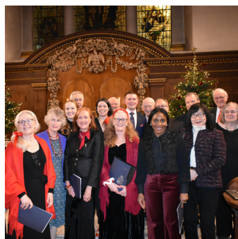
Choral Cocktail Evening