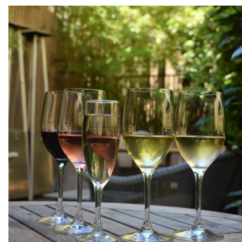
Tastings on the Terrace